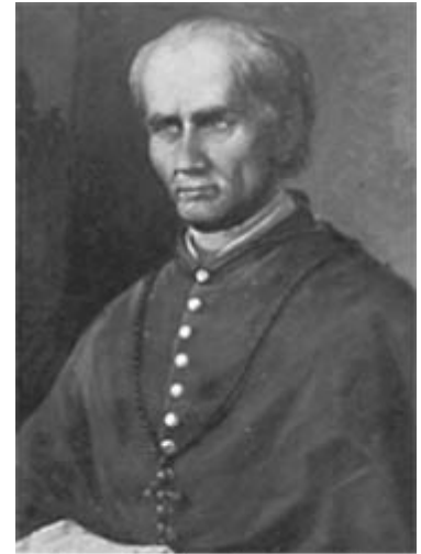
Joseph Sadoc Alemany, OP

California, having recently passed from Mexican to American rule and still containing a large Spanish population with Spanish customs and traditions, the appointment of Archbishop Alemany as the first bishop under the changed conditions was a providential measure. Ten years of missionary activity in Ohio, Kentucky, and Tennessee had enabled him to master the English language, which he spoke and wrote correctly and fluently. This familiarized Bishop Alemany with the customs and spirit of the Republic and imbued him with a love for the United States, which he carried with him to the grave.