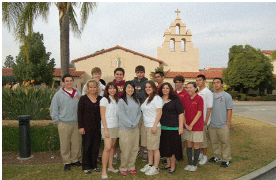
2006-2007 Southern California Regional Academic Decathlon Private School Champions

6. If a student is asked to withdraw from school and the parents fail to withdraw the student, the principal may exercise his or her prerogative to expel the student.