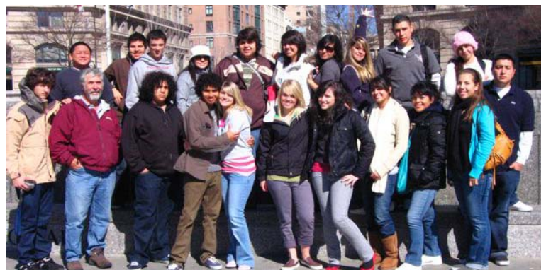
Close Up Trip 2007 Washington D.C.